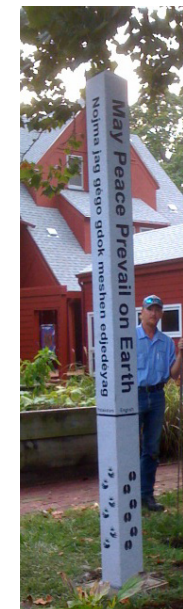
K-State Peace Pole September 21, 2009

There are more programs and events, too numerous to mention, including collaboration with Hale Library in the annual social justice film series, Movies on the Grass. The "Season" alone makes available a dozen or more speakers, films, and workshops each year. We also create awareness-raising posters, t-shirts, public service announcements and other materials to help make the abstract ideas of nonviolence more concrete and accessible.