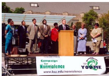
Inaugural CNV Rally, 2001

* Nonviolence Studies Certificate Program – This 15-hour certificate program is a major new academic initiative open to all UG majors through the K-State College of Arts & Sciences. See: http://www.k-state.edu/nonviolence/