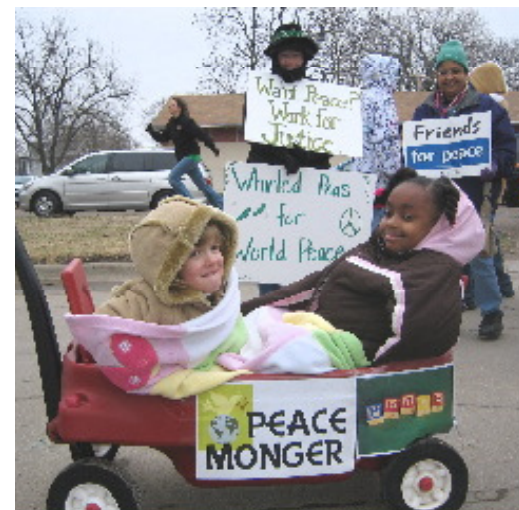
Manhattan St. Patrick's Day Parade, 2008

* Nonviolence Walk in St. Patrick's Day Parade - is a fun way to bring awareness of nonviolence teachings to the entire community. We know you can't change hearts and minds by countering a negative with another negative - so all of our signs share a way to practice the integrative power of nonviolence: "Want Peace? Work for Justice," kids dressed in green with signs, "Whirled Peas for World Peace."