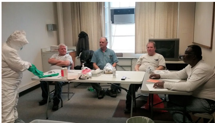
Bloodborne Pathogens Training