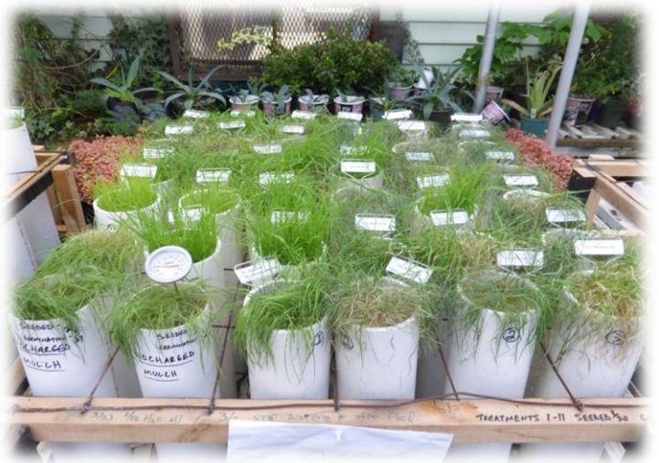
Study conducted in NSCC greenhouse investigating bentgrass cultivars for varying level of drought stress