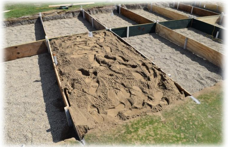
On-site evaluation of USGA recommended sand-based rootzones with various organic amendments growing of creeping bentgrass.

Superintendent Dan Dinelli emphasizes a strong environmental approach to each aspect of the golf course to enhance the ecological footprint.