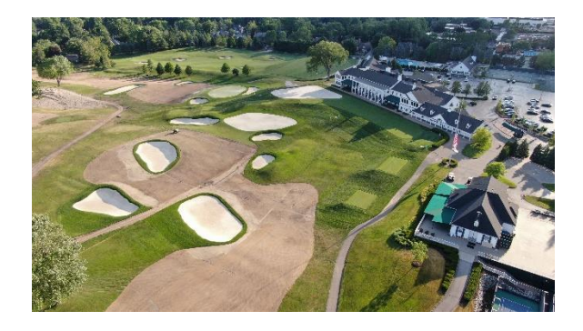
Fairways after non-selective herbicide application

We are looking for hardworking turf students who want to join our staff, as we put the finishing touches on the biggest renovation in the turf industry. At Oakland Hills, we strive to groom our employees for advancement within the organization.