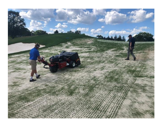
Topdress and aerify newly sodded approach

While at Oakland Hills, employees will participate in all facets of golf course maintenance required to maintain two championship golf courses at the highest level.