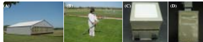
Fig. 1. The rainout shelter shields turf plots from rainfall and allows for precise of irrigation application (A). Reflectance was measured using a MSR 16 (B). The sensor head of MSR 16 radiometer (C) and keypad (D) are shown