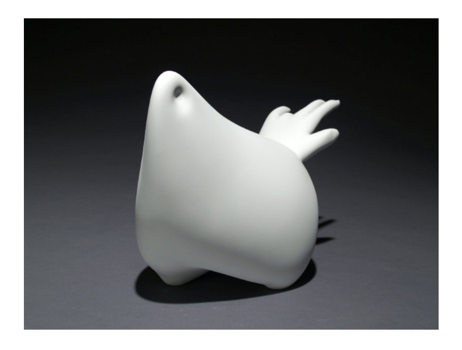
Untitled Luke Severson