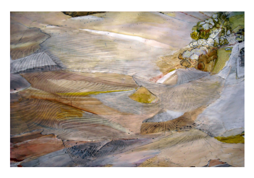
Valley of Tranquility Monique Belitz