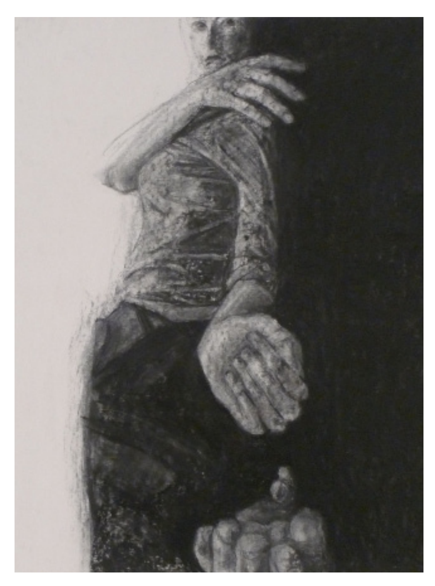
Lay Emily Glass