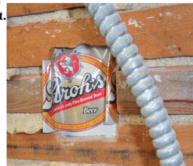
Does any alum know how this Stroh's beer can became entombed in the horse hair plaster & lathe?