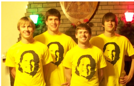
The Smithies Wear their favorite girl boldly on their chests for intramurals this year.