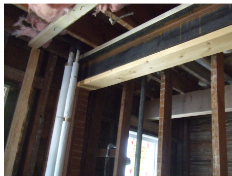
^ New structural beam in the Executive Director's Apartment.