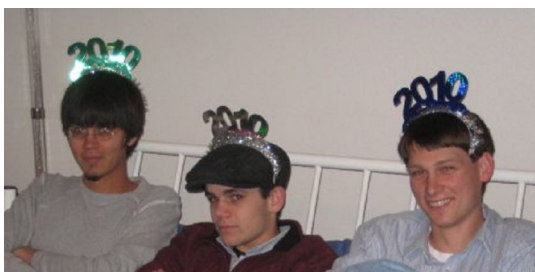
Three of Smith's Finest ring in the New Year by wearing girly tiaras.

His experiences with Upward Bound make up one of many lessons which he will