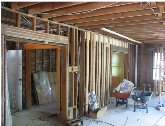
Renovations in living room, summer 2009.

We are pleased to announce that the first round of renovations is PAID IN FULL, and that Smith is careful to not incur a mountain of debt as some group living