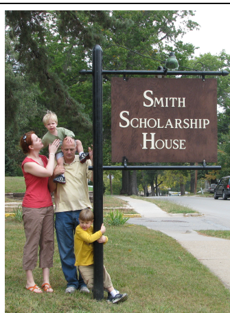
Many Memories Shared at Smith 50 th in October