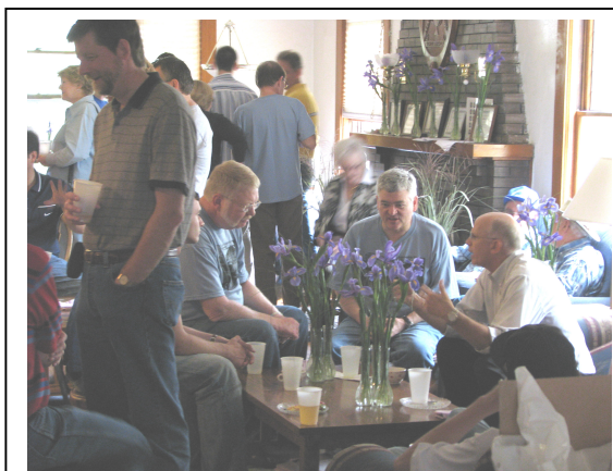
Smithies from every era chat at the Sunday brunch, held during the 50 th Celebration.