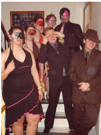
Several Smith and Smurths pose for a picture before the 2008 Formal at the Union Train Depot