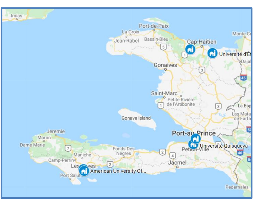
Item 2. Haitian Agricultural Universities

Although there are several universities which focus on agricultural education, the initial set of partner institutions include the following: