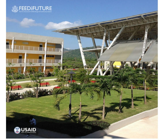
USAID partners with Kansas State University and Campus Henry Christophe de Limonade to launch an Agricultural Tech Park in the North.

University Partnership (HAUP) with Kansas State University. This park is one of a network of six centers across Haiti that HAUP will establish to showcase high-potential climate-smart agriculture technologies and strategies to sustainably intensify smallholder farmer production systems. Read the full press release below.