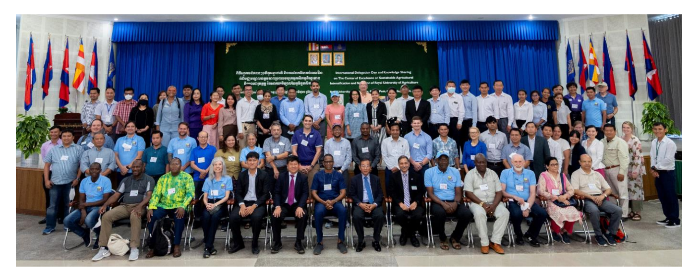
Participants at the 2022 SIIL Annual Meeting at the Royal University of Agriculture in Cambodia

Additionally, the last day of the meeting included traveling to visit different Agricultural Technology Parks, where participants could view several innovations that are being showcased in Cambodia while having time to engage and collaborate with other partners in SIIL's other focus countries.