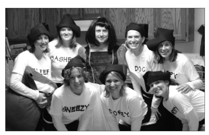
The prize-winning Halloween costume "Snow White and the Seven Dwarves" from the Fall 2005 GAPS party.