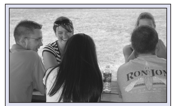
Grad students socialize at the Fall 2007 picnic.