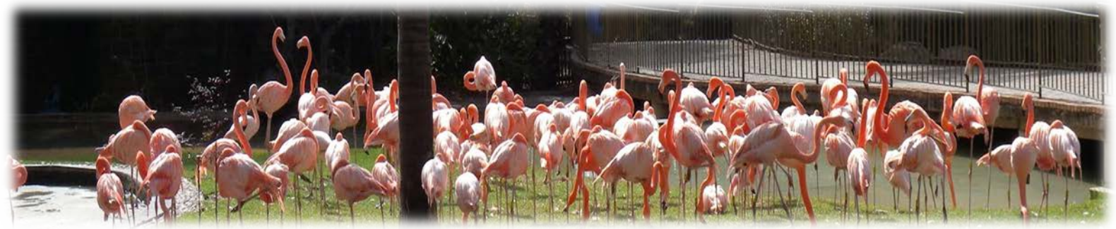
15 July 2010 National Zoological Gardens in Pretoria, South Africa