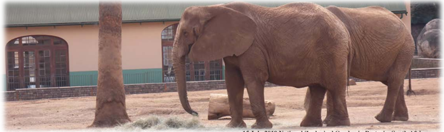
15 July 2010 National Zoological Garden in Pretoria, South Africa