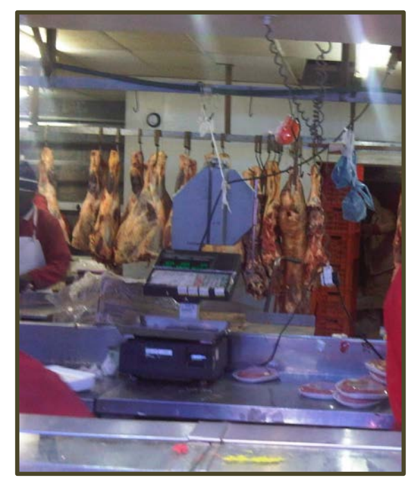
10 July 2010 Butchery in Johannesburg, South Africa

South Africa produces almost 85% of its own meat, leaving only about 15% to import.