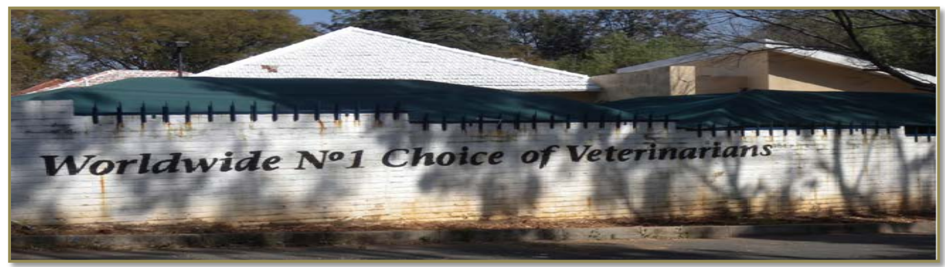
19 July 2010 Animal Emergency Clinic in Oakdene, South Africa

In 2008 , South Africa had an estimated 2,739 registered veterinarians and 865 registered veterinary practices. Veterinarians are employed in a variety of sectors<sup>11</sup>: