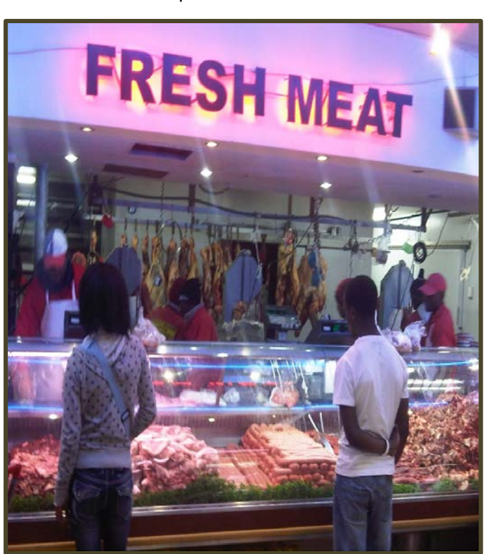
10 July 2010 Butchery in Johannesburg, South Africa

South Africa produces almost 85% of its own meat, leaving only about 15% to import.