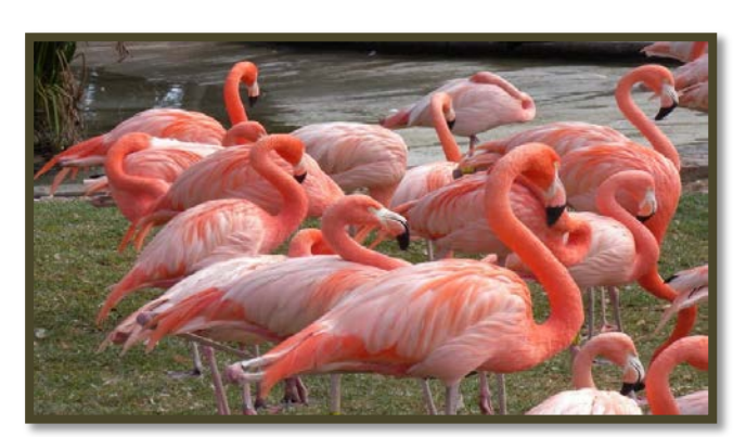
15 July 2010 National Zoological Garden in Pretoria, South Africa