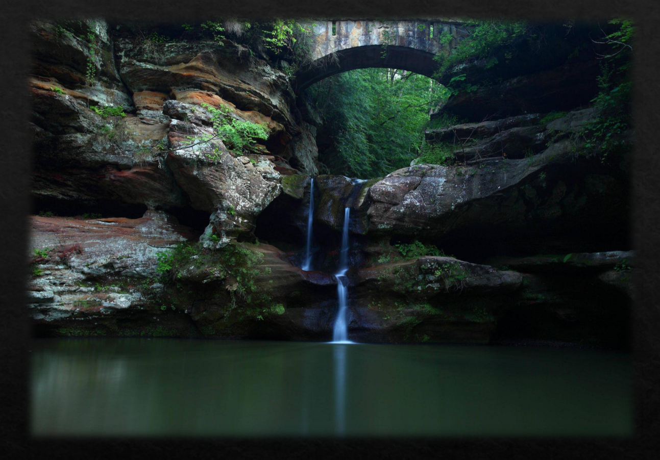
Old Man's Cave in Hocking Hills State Park