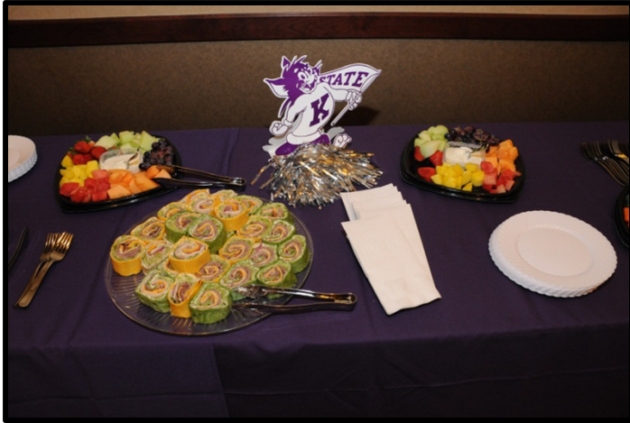
Hy-Vee catered the event.