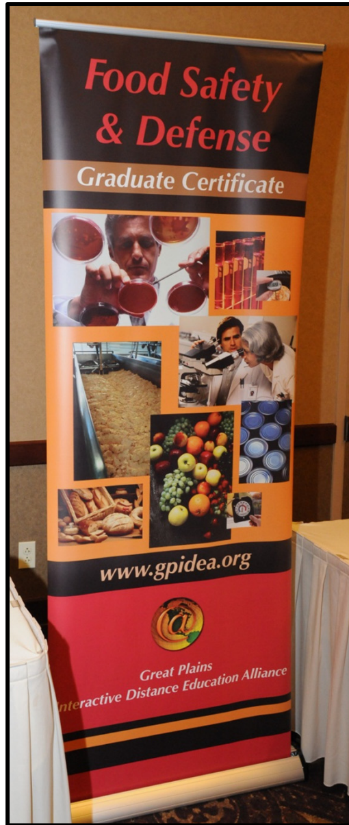
Food Science Institute