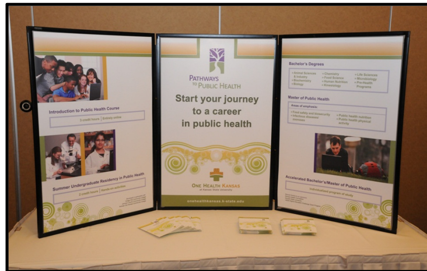
Pathways to Public Health