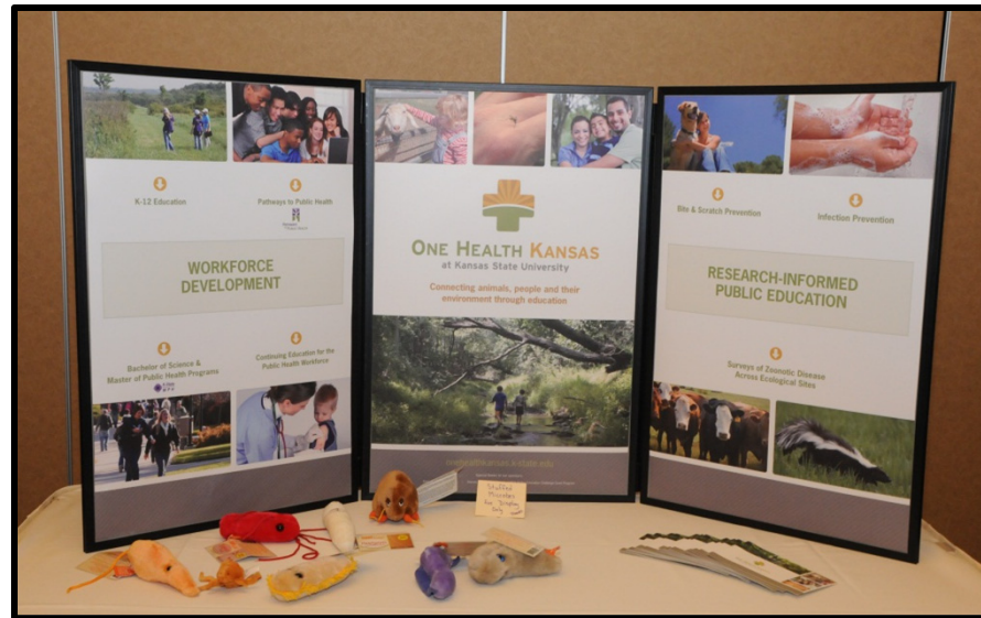
One Health Kansas