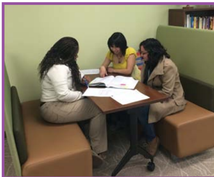
Scholars studying biochemistry

My father was a railroader. Through him, I learned to love trains. A favorite storybook of mine was the Little Engine That Could by Watty Piper. I loved that little engine underdog as it came up against the bluster of the bigger engines. "I think I can, I think I can, I know I can," a refrain learned as a child, became the mantra I tried many years later to instill in the Developing Scholars Program (DSP). DSP students were encouraged to think they could become doctors and lawyers, teachers and engineers, scientists and artists. Our students learned to take their dreams seriously. As a result, many DSP graduates have become medical doctors, teachers, optometrists, engineers, architects, chiropractors, wildlife ecologists, lawyers, dentists, accountants, and more. They have been Fulbright Scholars, Goldwater Scholars, National Institutes of Health Scholars, and Gilman winners. They have traveled the world.