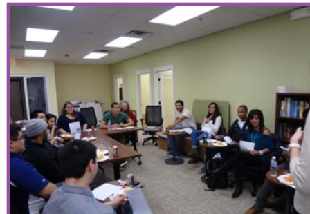
Students gather for workshop