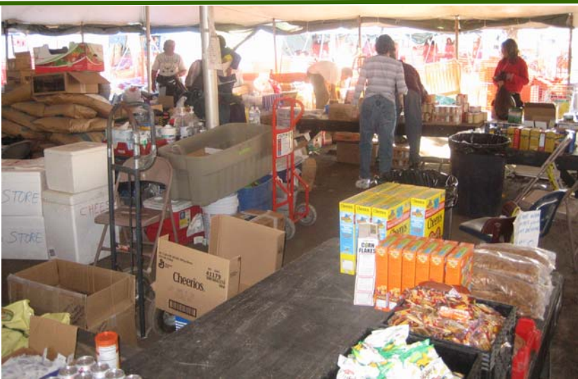
An aid tent in Mississippi after Hurricane Katrina. KAHBH would help to organize resources like this in the event of a Kansas disaster.

To aid in the preparation of our team members for disaster response, we have developed core and specialty trainings focusing on disasters and disaster response. The information in our trainings follows the FEMA/SAMHSA CMHS Crisis Counseling Program as the primary model. This model is based on "best practice" nationally recognized material. The trainings will be held state-wide and will involve each of the