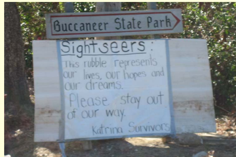
A sign outside Buccaneer State Park in Waveland, Mississippi, October 2005.

For more information about the KAHBH Core Trainings, please contact the KAHBH Program at kahbh@ksu.edu .