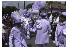
New Orleans style Second-Line. A Second-Line is a group of people parading the city to jazz music played by a live band.

Listed on pages 13 and 14 are events with dates, times, and places.