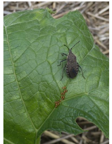
Squash bug with egg cluster.