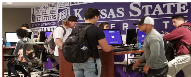
Computing lab in Student Union

Instructional designers are available to assist faculty in developing engaging and high quality learning environments. k-state.edu/its/instructional-design