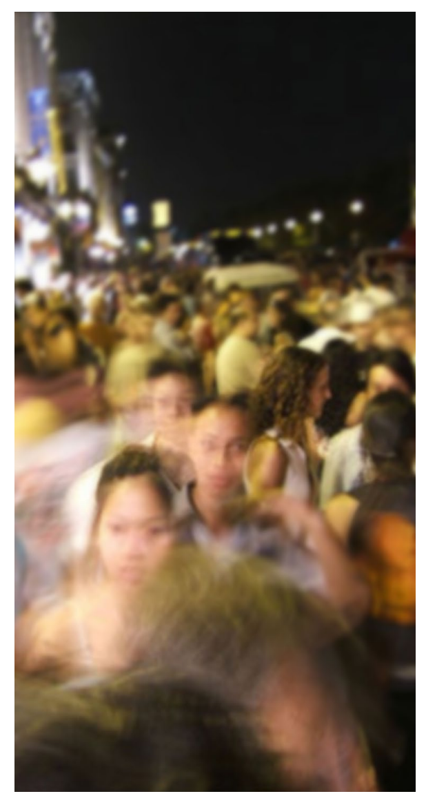
The U.S. Population is nearly 312 million and growing.

The current dearth of meaningful dialogue about America's unique demography also reflects the development of a bipartisan consensus celebrating the economic virtues of population growth. The disintegration of Keynesianism in the 1970s eviscerated the position that a rising population is entirely compatible with a growing economy. Around the same time, ascendant conservative economists