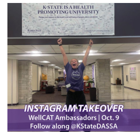
WellCAT Ambassadors hosted an Instagram takeover during HPU Week.