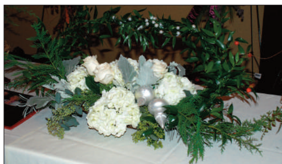
At left, a centerpiece made of greenery and white flowers can be used through the holidays.