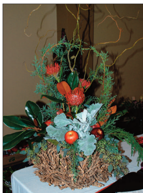
A twig basket designed by Hildegard was filled with greenery, magnolia leaves, spider chrysanthemums and fresh apples.