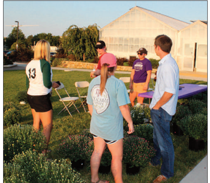
Horticulture club students held their annual chrysanthemums sale during the September Stroll.