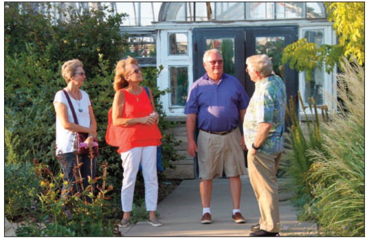
September Stroll visitors enjoyed beautiful weather, conservation, Call Hall ice cream and cookies from the Bakery Science Club, compliments of the Friends of the Gardens board members.