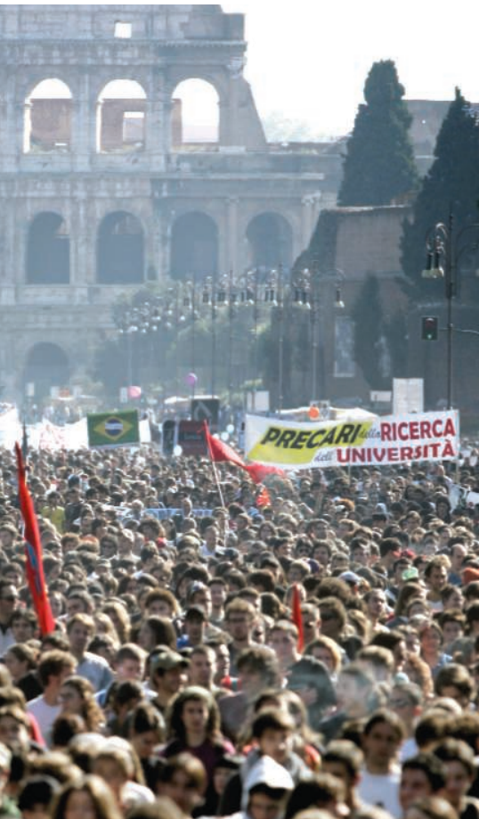
Researchers protest in Rome, 2005. Almost 100,000 participants protested the lack of concrete actions taken by the Senate to improve the conditions of research in Italy and to reduce the use of temporary contracts for researchers.

President, European Brain Research Institute, Via del Fosso di Fiorano 64, 00143 Rome, Italy.