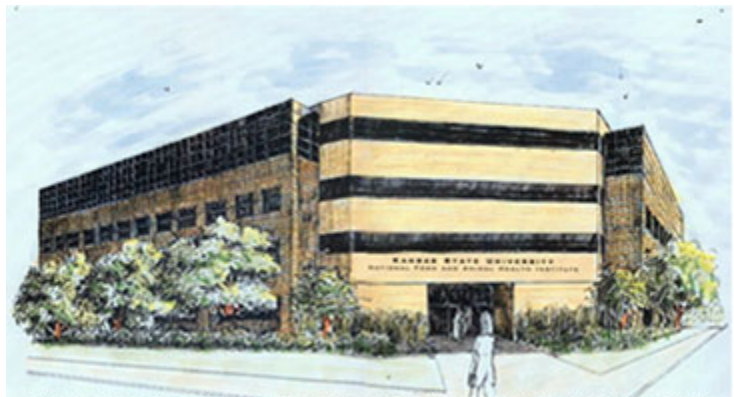
Artist's rendering of the National Food Safety and Animal Health Institute that will be constructed on the K-State Olathe Innovation Campus.