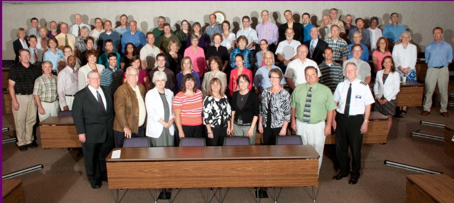
2009/10 Kansas State University Faculty Senate