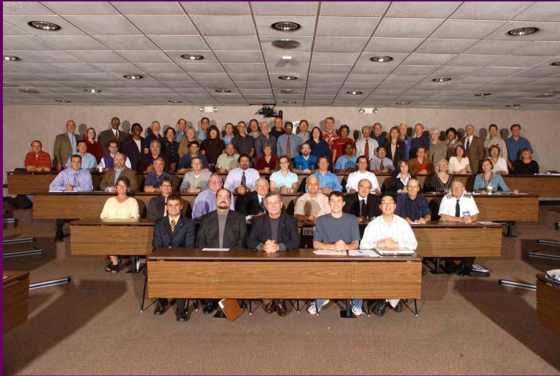
2007/08 Kansas State University Faculty Senate

Shared governance is a process in which the Faculty Senate plays a key role.