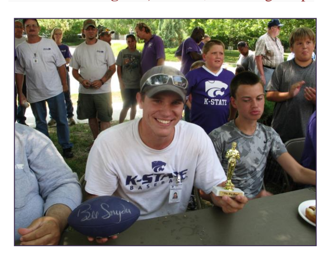
Tis dogs' delight to bark and bite thus does the adage run, but I delight to bite the dog when placed inside a bun.