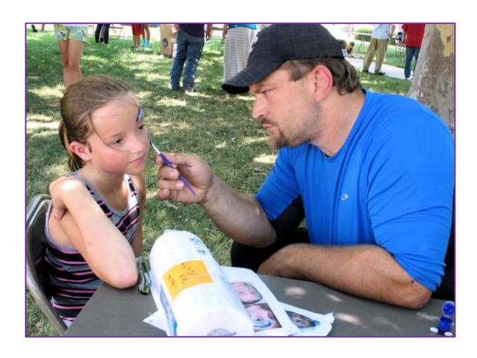
It doesn't get much more serious than this!