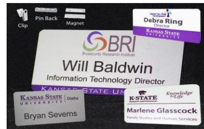
3" x 2" $5.00 and 3" x 1-1/2" $5.00

Facilities Storeroom has been in the "sign" business for quite some time. They continue to expand their creativity in this area. Their services include custom made signs and name tags.