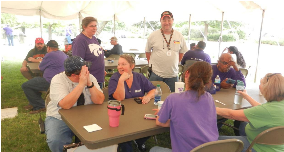
(ABOVE: The best part of an appreciation picnic is getting to relax, hang out, and catch up!)