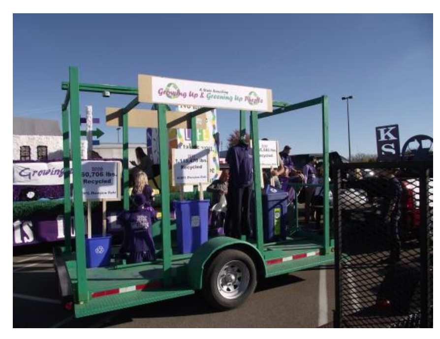
Recycling's Float for K-State's Homecoming Parade last month.