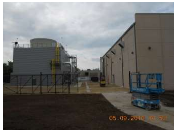
(right: Exterior view of Chiller Plant located north of Claflin road)

Construction on the Chiller Plant building is substantially complete as of the second week of May. There will be a two week testing and break-in period before the New Chilled Water Plant will be operational for K-State staff at the end of May.