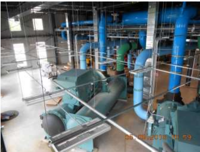
(above: Interior View of new Chiller Plant)

Construction on the Chiller Plant building is substantially complete as of the second week of May. There will be a two week testing and break-in period before the New Chilled Water Plant will be operational for K-State staff at the end of May.