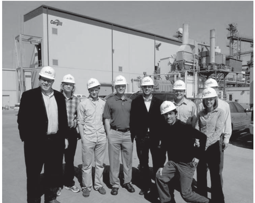
In April, the Economics Club took a field trip to Cargill of Wichita and Koch Industries. Read more about the club and the trip on page 5.

Of course, many students go on to major in economics. We have been fortunate to attract some of K-State's best and brightest to the major, and you can read about some of them in this newsletter. But, we know that a deep