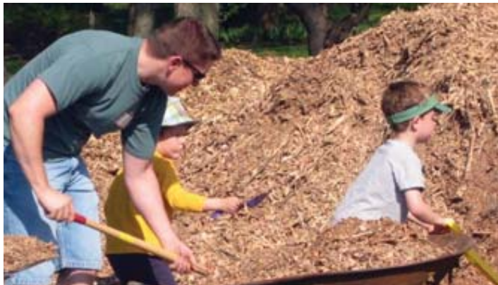
Volunteers participate in an event hosted by the center.