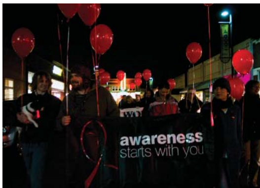
The World AIDS day walk in Manhattan.

are not; until there is a cure for this disease I do not expect I will feel any differently."