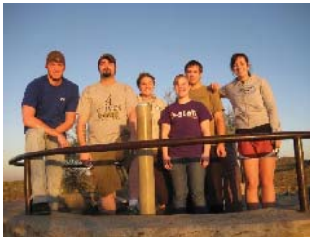
The Phoenix, Ariz. alternative spring break team poses for a photo.