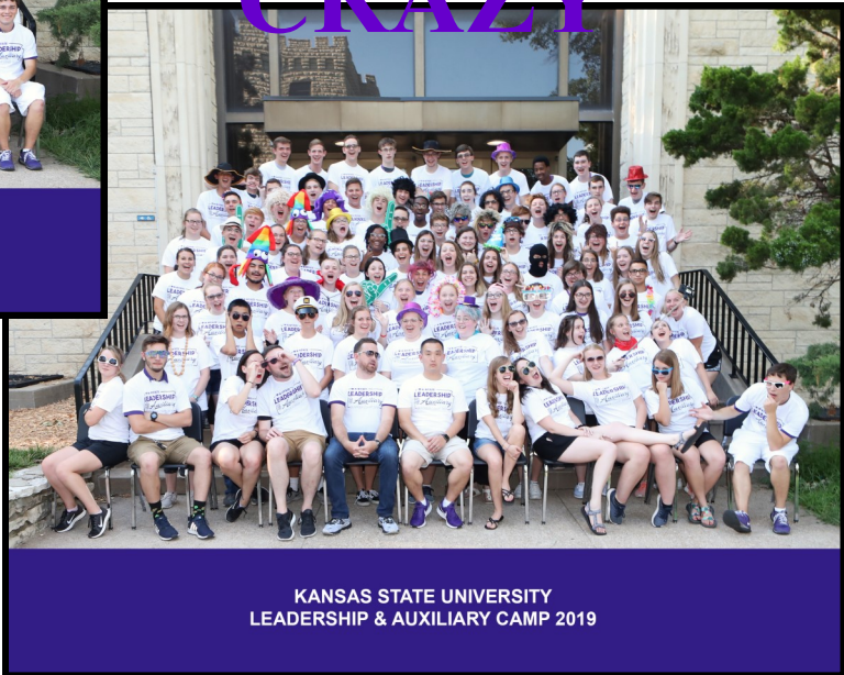
KANSAS STATE UNIVERSITY LEADERSHIP & AUXILIARY CAMP 2019