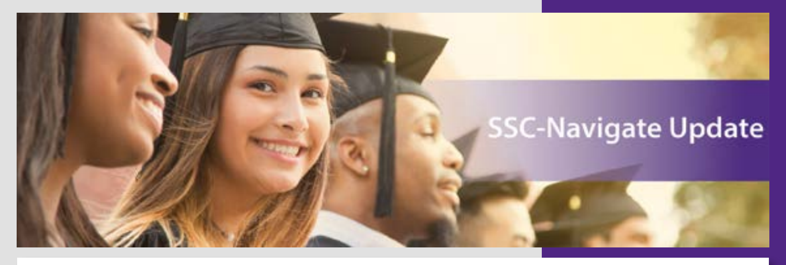
Issue 3, September 13, 2021