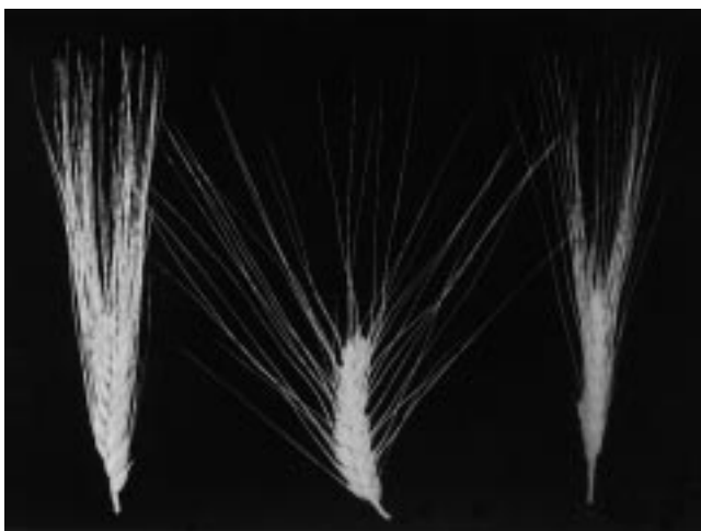
Fig. 2. Spike morphologies of the recipient durum wheat cultivar Cando (left), the Ti4AS·4AL·6R#1L·4AL durum wheat germplasm (middle), and the T1BL·2R#2L durum wheat germplasm (right).

Five BC2F1 plants were obtained, which had 2n = 28 (3) and 29 (2) chromosomes and two of them were heterozygous for Ti4AS·4AL·6R#1L·4AL. These plants had normal spike morphology and were selfed. All BC2F2 seeds were plump and white and the chromosomal constitution was determined in 11 of them. All