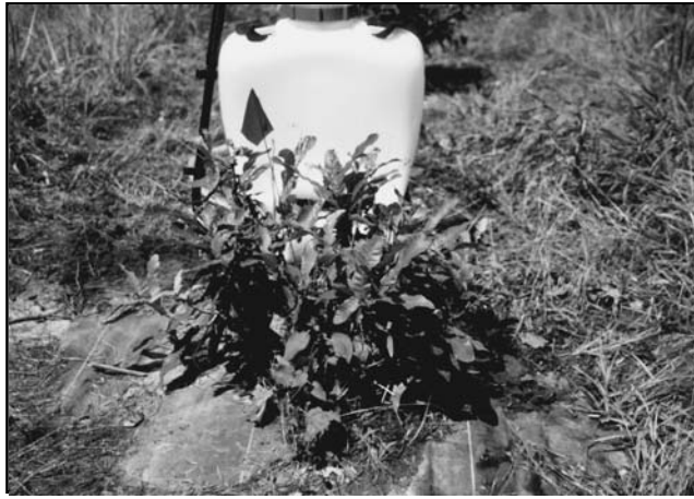
Figure 2. A five-year-old oak seedling less than two feet tall due to heavy deer browsing.

from deer damage. At remote sites these are powered by a 12-volt vehicle battery. An alternative protection system uses plastic tubular tree shelters, 4 to 5 feet tall (Figure 3) to prevent browsing and rubbing. These have the added benefit of increasing early height growth and making mowing and herbicide applications easier because seedlings are easily located and protected from herbicide drift. A number of commercial and homemade deer repellents have shown variable, limited success.