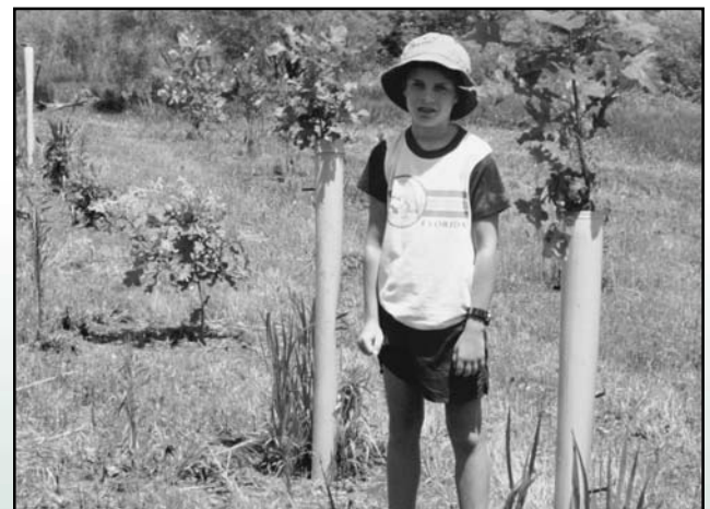
Figure 3. Bur oak seedlings beginning their second growing season, already emerging from four-foot shelters. Note the shorter, unsheltered trees in the background.

For further help establishing a riparian buffer, contact your local National Resources Conservation Service (NRCS) office or Kansas Forest Service district forester.