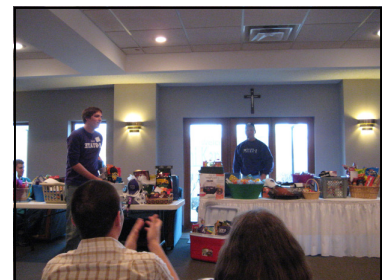
Above: A picture from the Mothers basket Auction that raised close to $1200 in funds for the parents club.

It was a very successful event as more than half of the house's dads were able to come out. After golf, we all came back and had smoked ribs for dinner, prepared by Zach Simons Dad, and watched the 2008 NFL Draft.