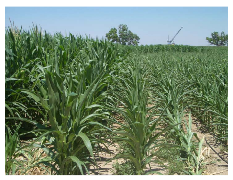
Figure 2. Comparison of corn growth condition on July 31, 2008 just before tasseling. Rows at the left and background are fully irrigated; rows at right are the lowest irrigation level.