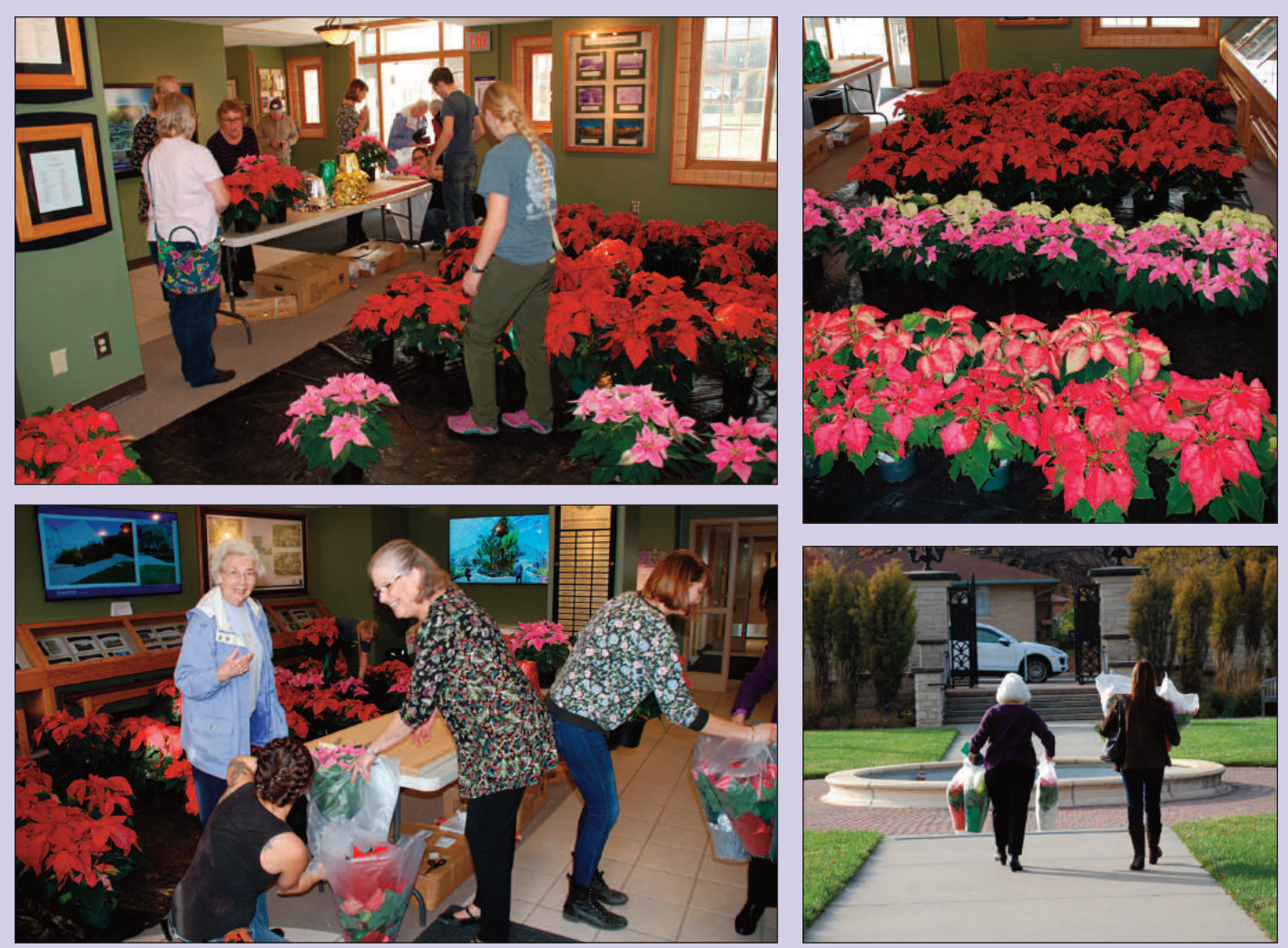
The Friends of the Gardens sponsored another successful poinsettia sale this year with proceeds of $2,500+, with sales of 450 poinsettia and 40 amaryllis plants.