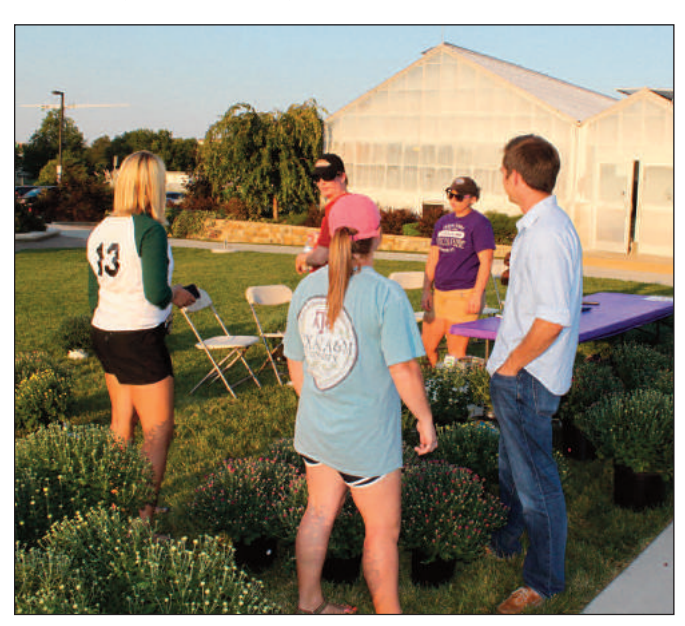
Horticulture club students held their annual chrysanthemums sale during the September Stroll.