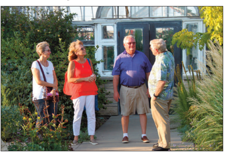
September Stroll visitors enjoyed beautiful weather, conservation, Call Hall ice cream and cookies from the Bakery Science Club, compliments of the Friends of the Gardens board members.