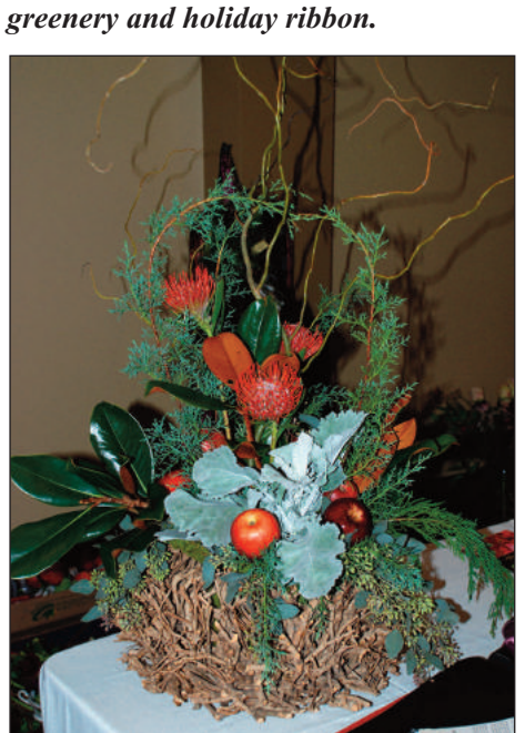
A twig basket designed by Hildegard was filled with greenery, magnolia leaves, spider chrysanthemums and fresh apples.