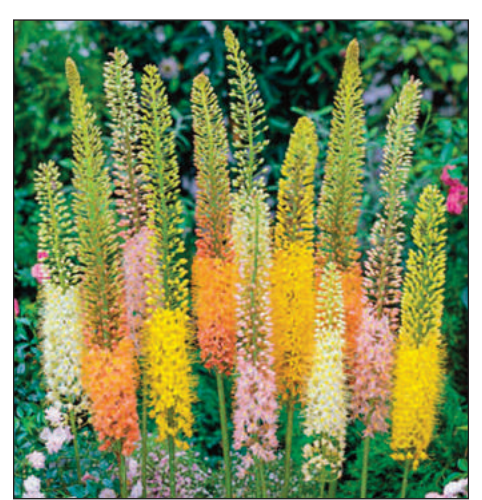
Foxtail lilies are a dramatic addition to any garden and add texture, interest and color. Unique flower spikes bloom in early summer and are highly attractive to butterflies and hummingbirds. See them at the Gardens this year.