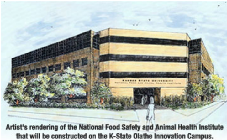
Artist's rendering of the National Food Safety and Animal Health Institute that will be constructed on the K-State Olathe Innovation Campus.