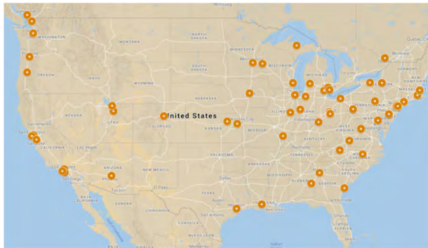
Figure 1. Mapping of all Industrial Design schools in the US.

Through our research of over 80 schools with industrial design programs, we created a map highlighting the locations of US institutions with industrial design programs (Figure 1). When viewed in consultation with Bureau of Labor Statistics job market demands map (Figure 2, located in Section V. Employment), one can see the need for greater education opportunities for industrial designers in the Midwest. The University of Kansas (BFA in Industrial Design) is the closest institution with an