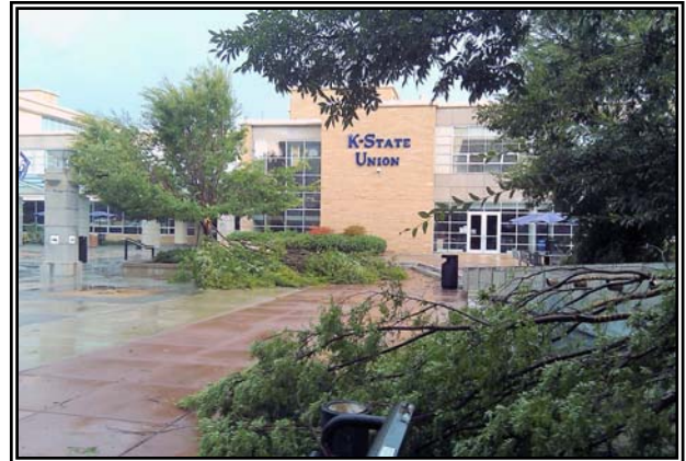
Below: Trees at K-State Union Plaza ripped and broken off.