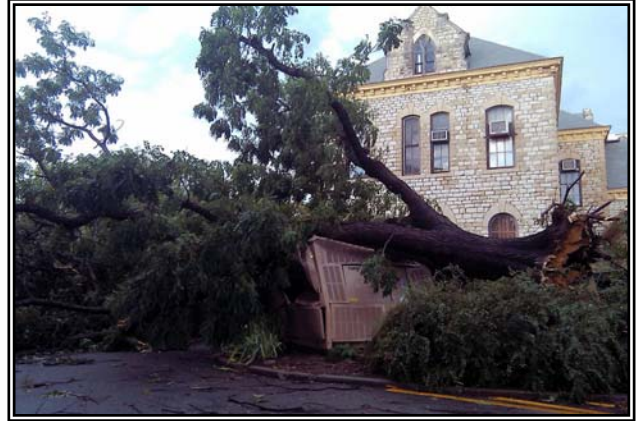
Above: A tree behind Anderson Hall broken off and lying on the chiller.