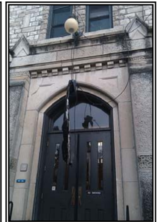
Above left: Part of the roof from Anderson Hall.