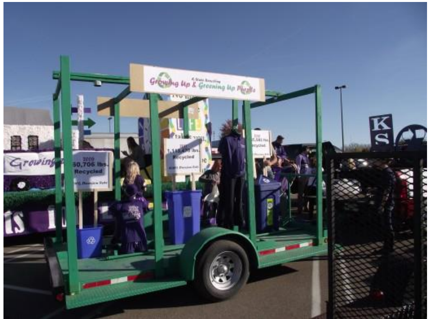
Recycling's Float for K-State's Homecoming Parade last month.