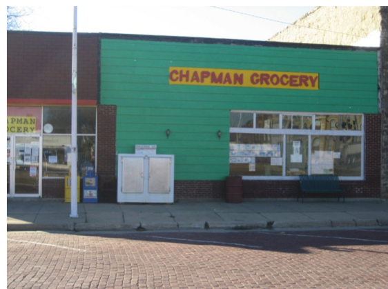
Chapman Grocery located in Chapman, KS.