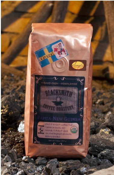
Papua-New Guinea Coffee, one of the many flavors of coffee that Blacksmith Coffee offers.

"We've taken the approach to focus on independent stores because they are like the lifeblood of the community. When those grocery